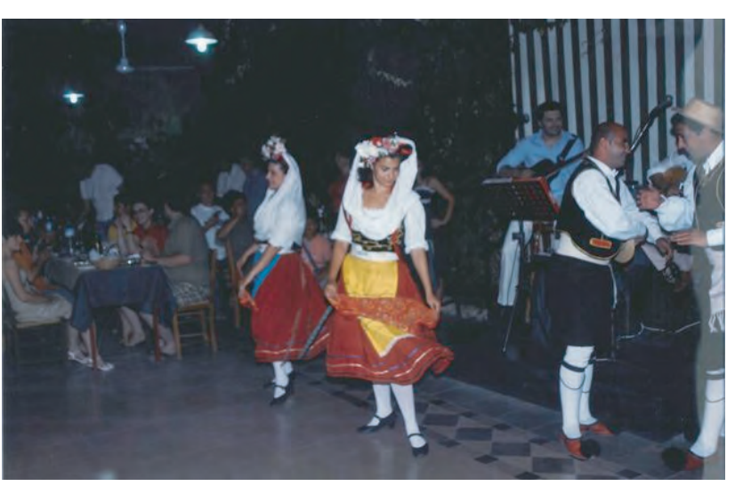
Greek dancers at Tripas

Lunch followed at the traditional restaurant in the old town, Rex, where apart from food,