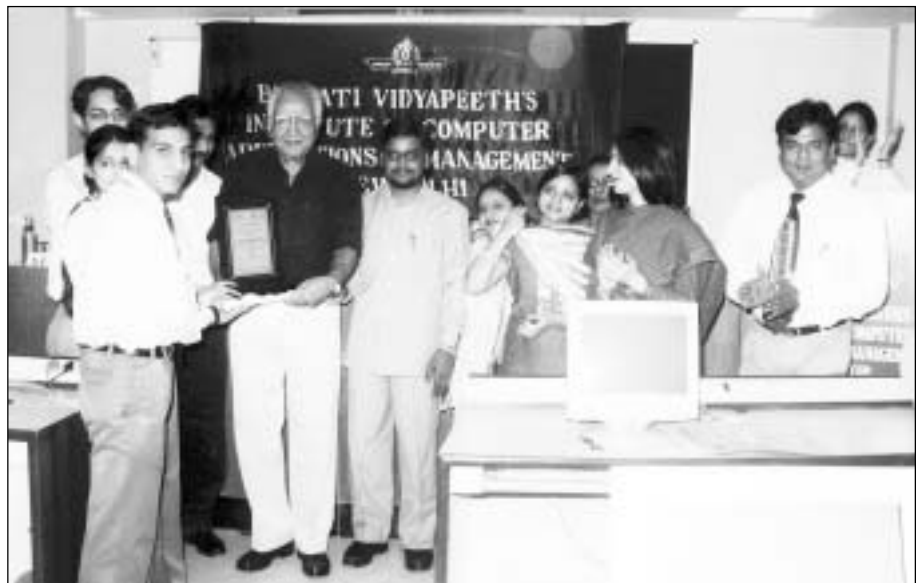
Bharati Vidyapeeth, Delhi : Felicitating function for the students of Bharati Vidyapeeth's Institute of Computer Applns. and Mgmt.