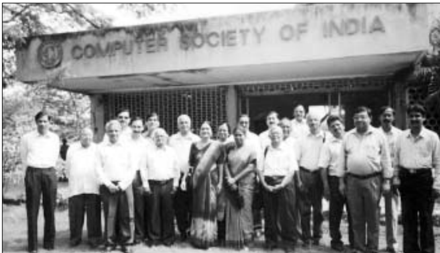
Members of Executive Committee visited CSI Education Directorate, Chennai on 24th April, 2005. Group photo taken on the occasion with the Hon. Director & staff members.