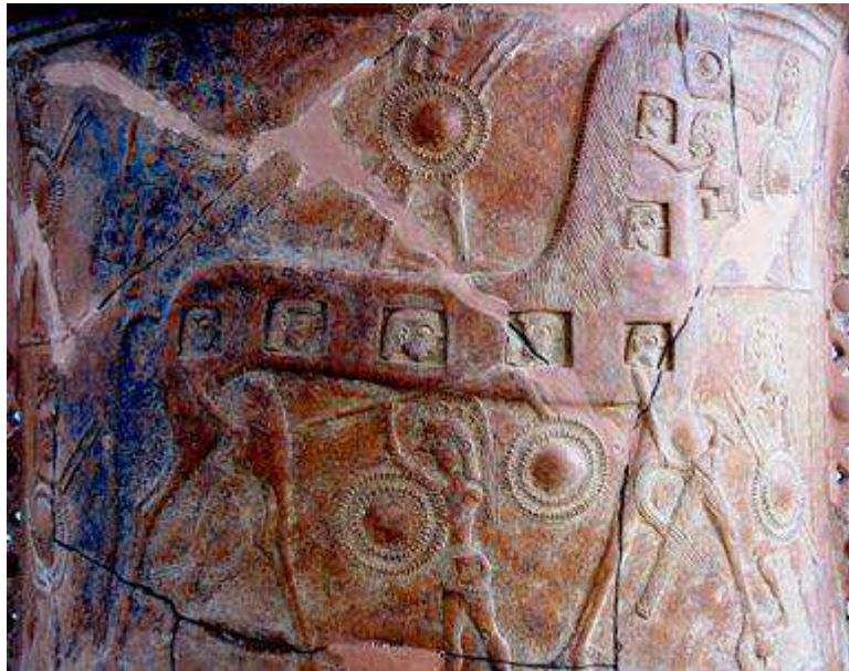
Pithos of Mykonos

Detienne and Vernant point out that Odysseus was polimētis and polumechanos , always able to find a means to extricate himself from hopeless situations ( áporoi ). Athena and Hephaistos, who are both mētis gods, were his teachers. He was able to make all kinds of crafty devices ( panourgos ) (Detienne and Vernant 1974, 25-27). Also, it is worth noting, Hermes was called polumētis (Detienne and Vernant 1974, 266).