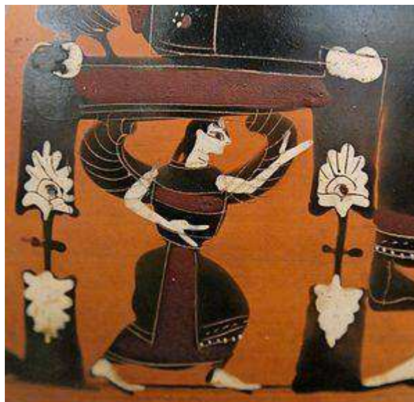
A winged goddess depicted under Zeus' throne, possibly Metis. https://en.wikipedia.org/wiki/Metis_%28mythology%29