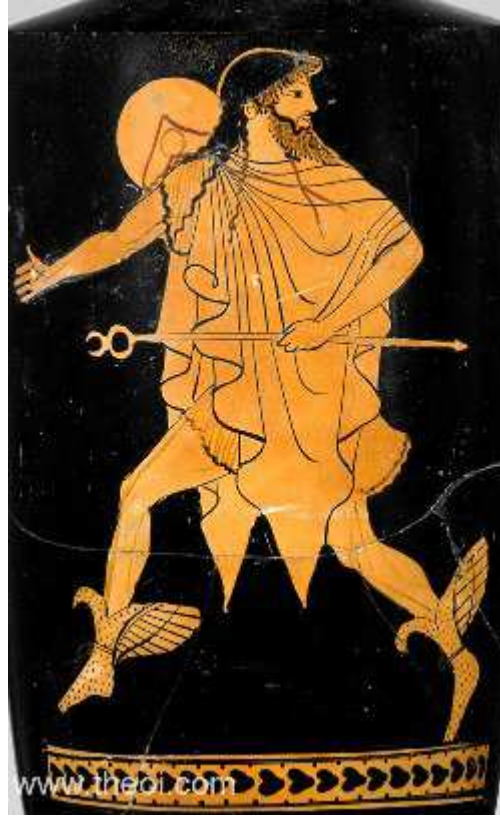
Hermes, Athenian red-figure lekythos 5th BC. Metropolitan Museum of Art

The other messenger of the gods is Hermes, the protector of human messengers, travellers, thieves, merchants, and orators.