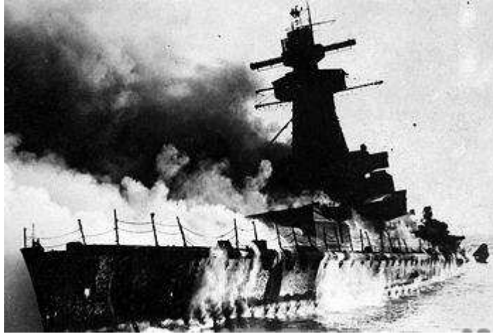
The scuttling of Admiral Graf Spee

https://de.wikipedia.org/wiki/Admiral_Graf_Spee