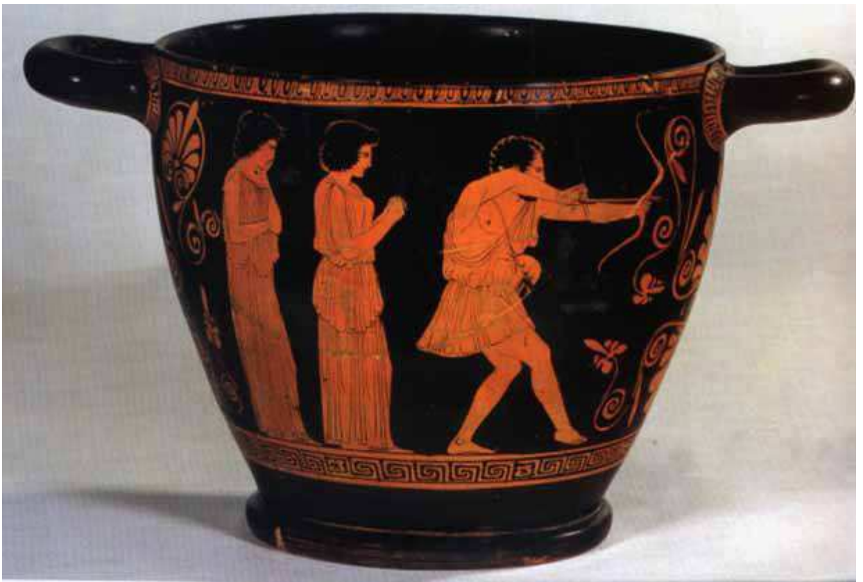
Red-figure Skyphos of the Penelope Painter, 450-435 BC. Berlin, Staatliche Museen

The false inference is based on the presupposition that the observer believes that he recognizes someone with a bow as being Odysseus while this is not necessarily the case.