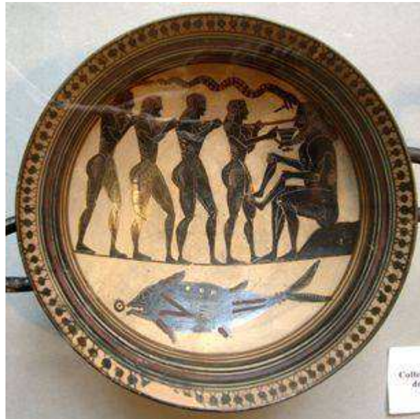
Odysseus and his men blinding Polyphemus. Laconian black-figure cup, 565-560 BC.